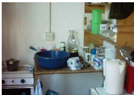
It may be small but it's a kitchen we can cook in.

The future for the work here is looking good. Not only is there the possibility of more teaching at the Bible College, but there is also an increased interest in the English and Computer Lessons as we are beginning to get known for what we do. In order to help us increase the number of students we can cope with, the charity trustees are hoping to soon have the finance for another computer. We hope to have more news regarding these developments for the next newsletter.