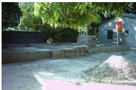
2 New Classrooms are being built, as God supplies

It's newsletter time already, how fast the time seems to go these days. There is so many things for us to be doing, that there never seems enough hours in the day to fit it all in. There have been several groups staying in the house during May, so we have been even busier than normal since we got back from the UK. The scripture that comes to mind is; 'the fields are white unto harvest, but the labourers are scattered and few. Pray therefore that the Lord of the harvest .....'!